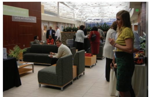
The reception area of the Center for Tissue, Innovation and Research.