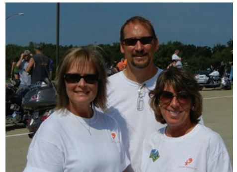
Community Tissue Services staff at the event.