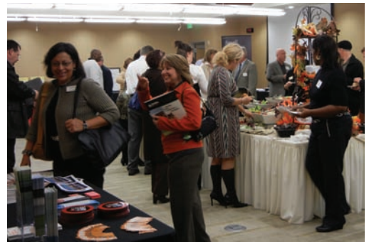
Attendees visit the exhibits and enjoy the refreshments.