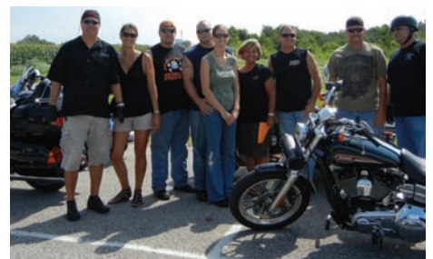
A group of bikers gather before Noah's Ride.