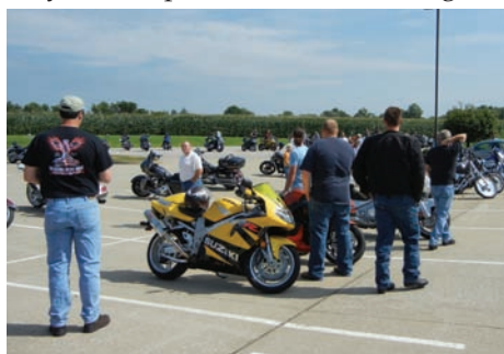
Bikers in formation start the Ride.